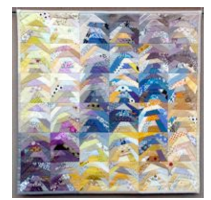
Please note that this quilt is not necessarily the subject of Ursula's workshop