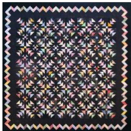
2011 Santa Monica Quilt Guild Opportunity Quilt to benefit the YWCA Santa Monica/Westside Songbirds at Midnight 83" x 83" Tickets $1 each or 6 for $5

The 2011 Santa Monica Quilt Guild Opportunity Quilt is on the move. "Song Birds at Midnight" (83" x 83") is being raffled to benefit the YWCA Santa Monica/Westside. Tickets ($1 each or 6 for $5) will be for sale at SMQG meetings and events. Check out the SMQG website, SantaMonicaQuiltGuild.org for further information on the Opportunity Quilt and the August 13 Quilt Show.