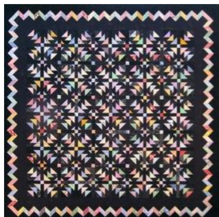
2011 Santa Monica Quilt Guild Opportunity Quilt to benefit the YMCA Santa Monica/Westside Songbirds at Midnight 85" x 85" Tickets $1 each or 6 for $5

For all the details about the August 13 one-day quilt show, see the guild website, www.SantaMonicaQuiltGuild.org . Tickets are $5.00 for the 1-day event. Hours are 9:00 AM to 5:00 PM. First United Methodist Church at 1008 11 th Street, Santa Monica. Free parking.