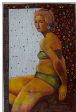
(Far left) Malibu Beach, 29"w x 32"h